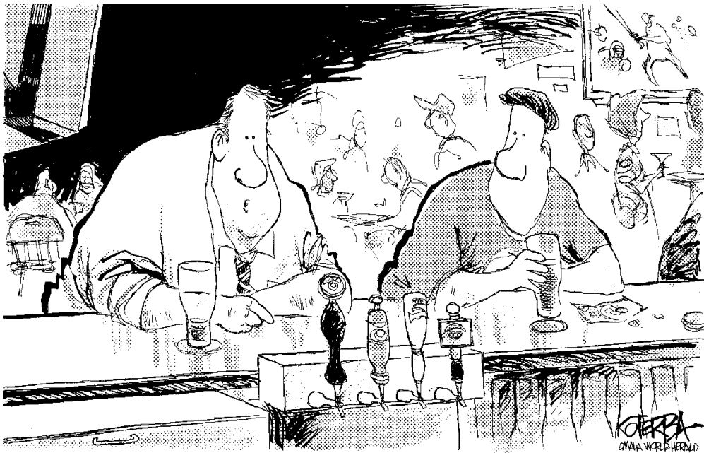
"SOMEHOW, I THOUGHT MY LIFE WOULD IMPROVE WHEN PARIS HILTON WENT BACK TO JAIL."