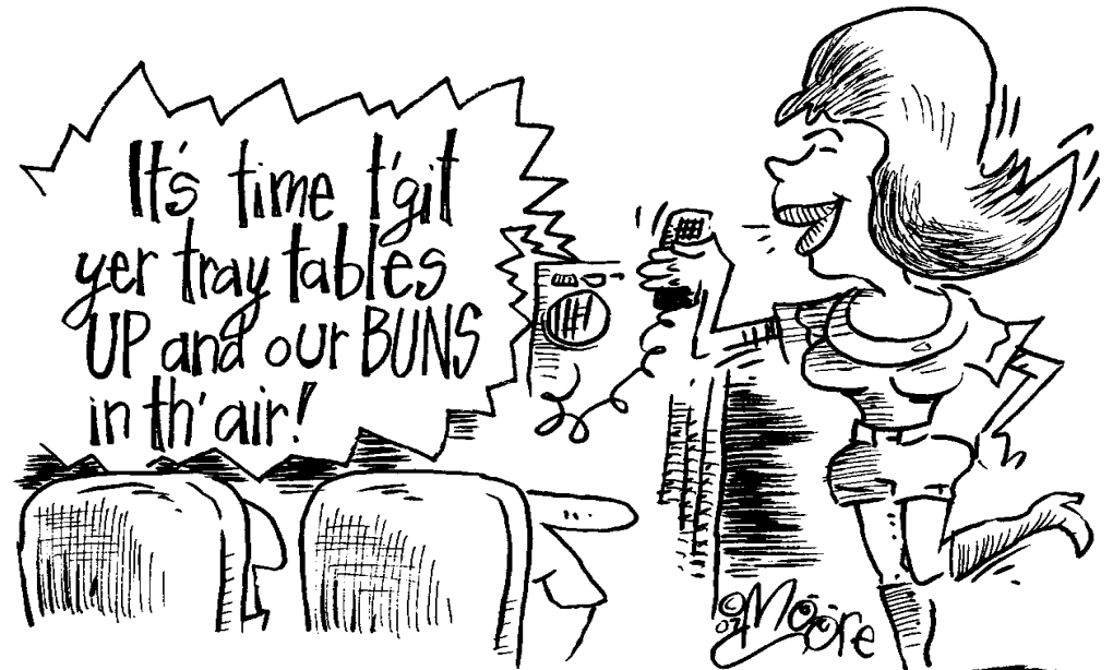
June 18, 1971: Southwest Airlines begins with a flight out of Love Field in Dallas.