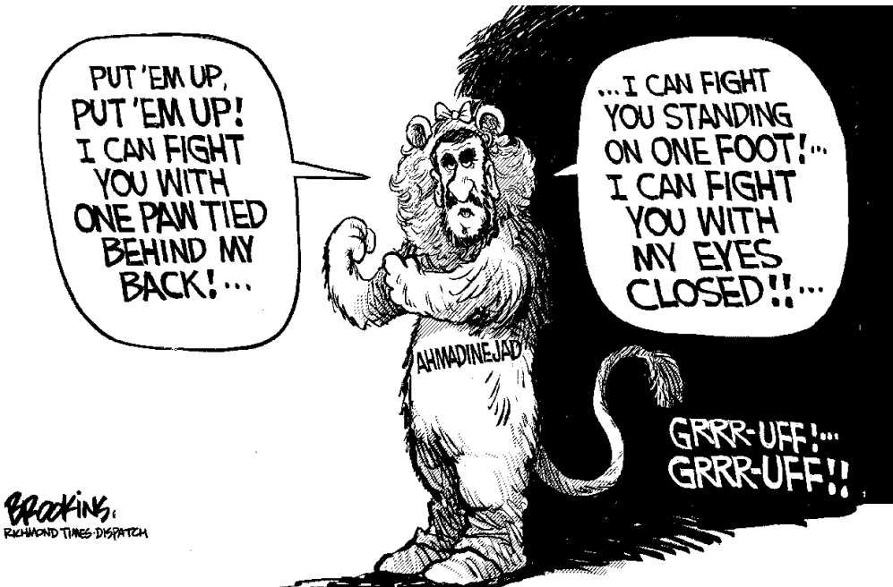
The LION of IRAN