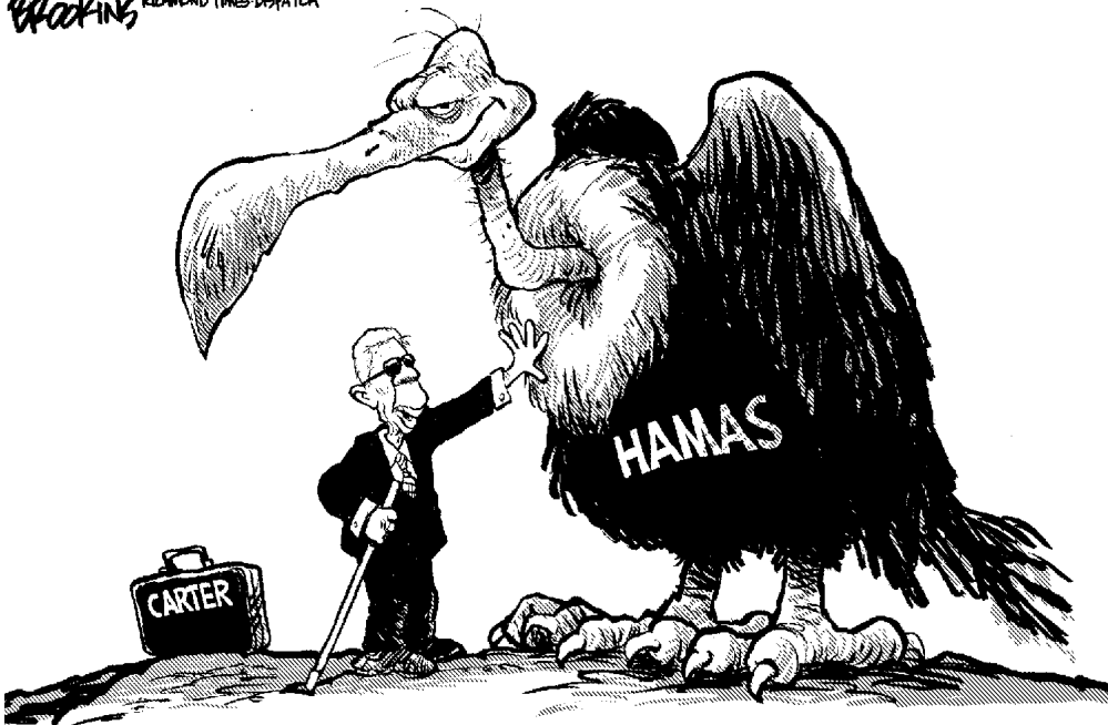
"WHY, IT HAS SOFT, FLUFFY FEATHERS...IT MUST BE A DOVE!"