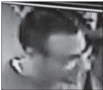
Do you know him?

Stoppers “Crime of the Week.” On the afternoon of Sunday, April 27, 2014, just minutes after three, a man walked into the Seven Eleven Store located at 10026 Montana. The man asked to purchase some electronic cigarettes and tried to pay for them with a check and then a debit card, which were both declined. At that point,