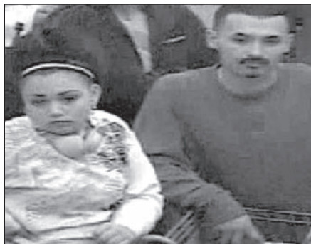
Do you know them?

A couple attempted to steal a computer from an east El Paso store, and they were recorded on video. Detectives from the El Paso Police Department are asking for your help in identifying them through the Crime Stoppers "Crime Spot." The incident took place around three in the afternoon on January 9, 2014, at the Walmart store located at 10727 Gateway West. According to security personnel at the business, the couple walked through the store and began to select a few clothing items and placed them in a shopping cart. The couple then walked to the electronics section, where they selected a Hewlett Packard computer and placed in the cart. The pair then walked to the front of the store, where the cash registers are and walked out of the store. Security personnel managed to stop the couple and took them to the security office. During that time security personnel was unable to learn or confirm the identity of the two. The female was released by the security personnel and moments later, the male suspect managed to run out of the store to an awaiting car.