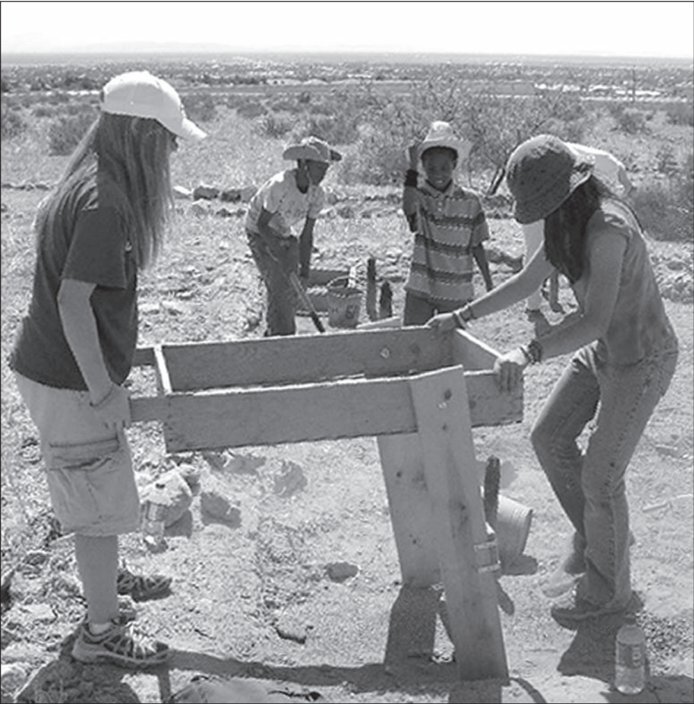
HANDS ON – Students learn how to excavate a site during camp.

For more information and camp registration form, contact the museum at 755-4332, or send email to maloofgo@elpasotexas.gov .