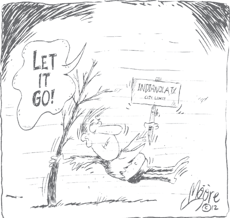
Moore Texas by Roger MOORE September 17, 1875: A deadly hurricane in Indianola kills 900. Although rebuilt, another storm in 1876 finished it off.

This is a simple substitution cipher in which each letter used stands for another. If you think that X equals O, it will equal O throughout the puzzle. Solution is accomplished by trial and error.